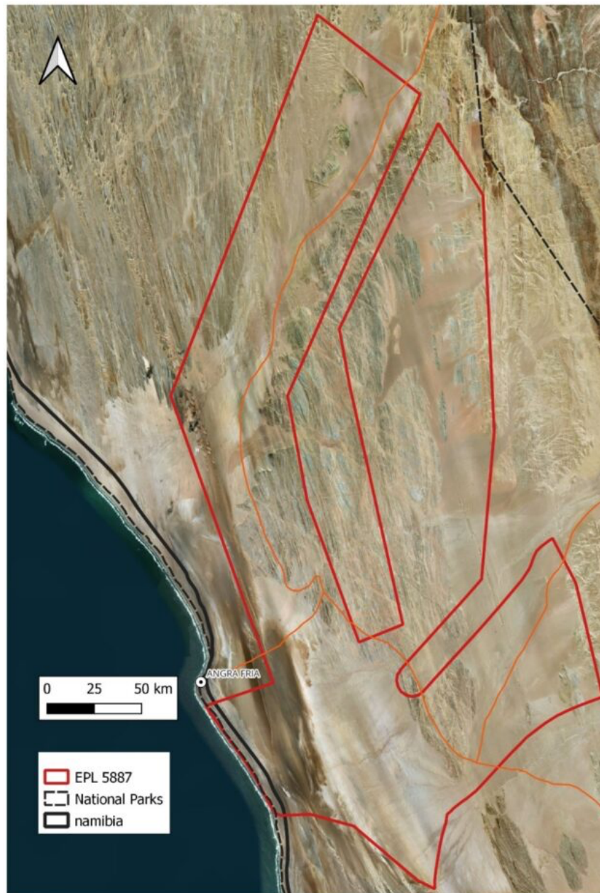
Figure 2: The Engrafria Uranium Project, indicating "Angra Fria" or Cape Fria, the site of a proposed 3 rd Namibian Atlantic port. 6

Exclusive Prospecting License EPL 5887 (the " License ") is registered in the name of the Project Company and covers a surface area of approximately 68,283 hectares (See Figure 2). The License was granted for industrial minerals, non-nuclear fuel minerals, nuclear fuel minerals, precious metals and precious stones, which includes uranium.